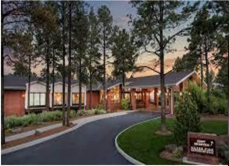
Little America Hotel